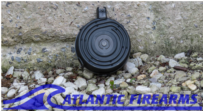
AK 47 75 Round Drum IMAGE