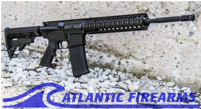
AR-15 Rifle FEDARM FR-15 image