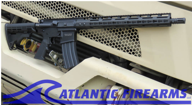
AR-15 .300 BLACKOUT IMAGE